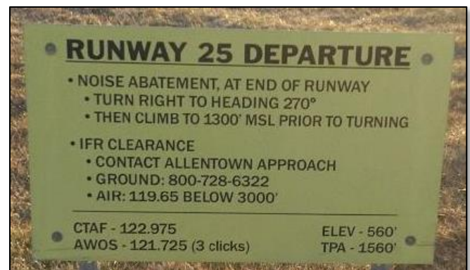
FIGURE 4 - SKY MANOR RUNWAY DEPARTURE ADVISORY SIGNS WITH NOISE ABATEMENT PROCEDURES